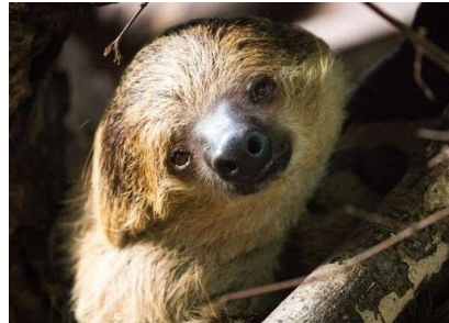
(Linne's) Two Toed Sloth

Rainforest Life is an indoor walkthrough exhibit, allowing you and your students to get a close look at some amazing rainforest animals. Here are a few of the amazing animals who live in this area: