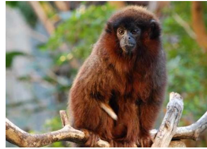
Red Titi Monkey